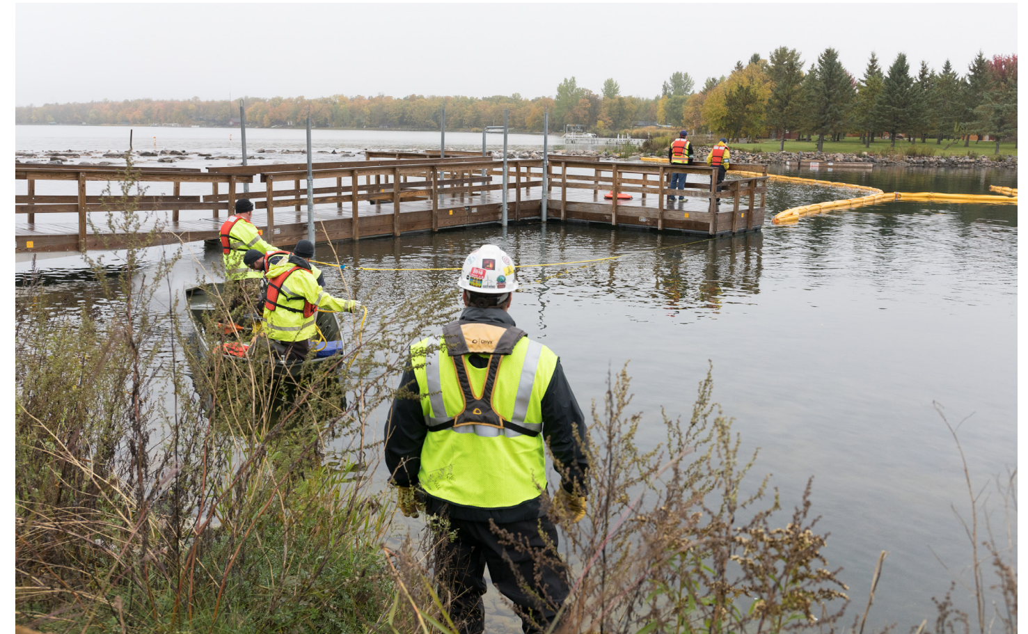
► Emergency response preparedness training exercises are collaborative drills between Enbridge and external response organizations and agencies.

Our underground pipeline system is part of the world's longest liquid petroleum pipeline system and has expanded to meet market demand over the years. Today, we continue to expand to meet transportation needs of energy producers and refiners for growing supplies of North American crude oil.